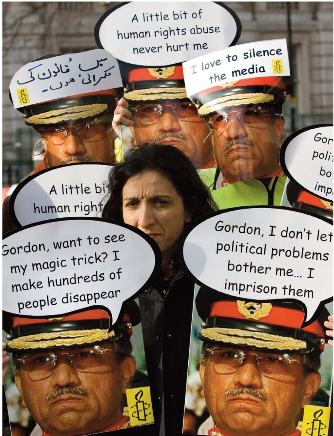
Amnesty International activists and lawyers demonstrate outside Downing Street to protest against the serious human rights abuses in Pakistan during President Pervez Musharraf visit to London on January 26.