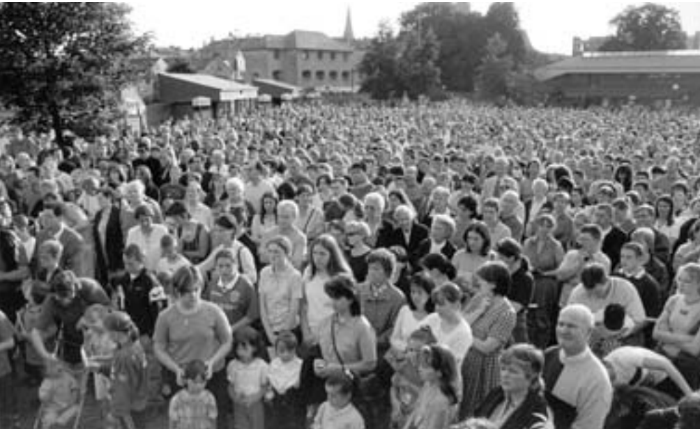
Above: Thousands of people turned out for the vigil on the eve of the funerals.