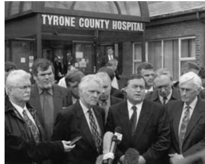
Left: John McFall, Economy Minister for Northern Ireland, shows Britain's Deputy Prime Minister John Prescott the scene of the devastation when he visited the town on Sunday.