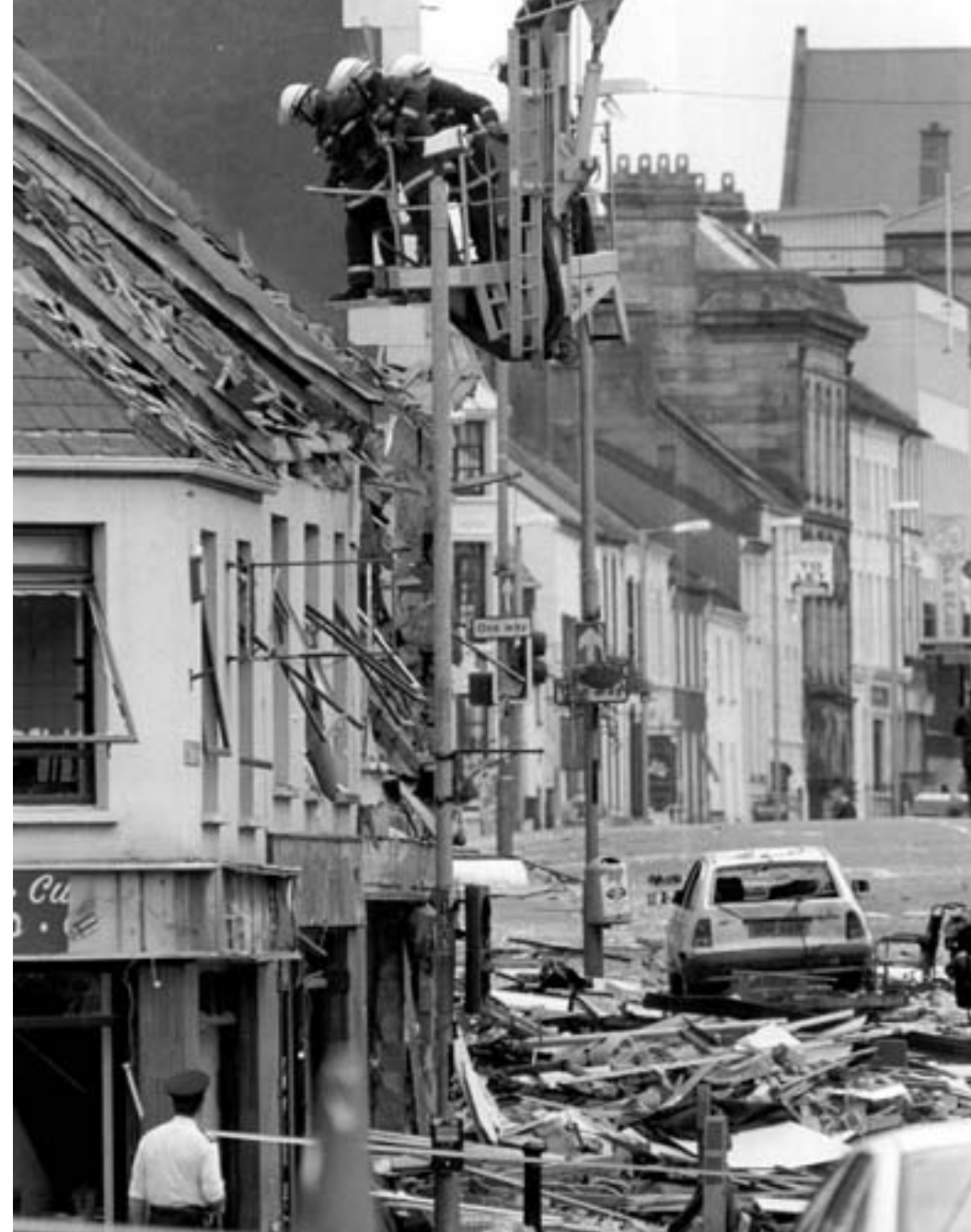
Right: Firemen use cranes to help them examine the remains of a building as the search for victims continued.