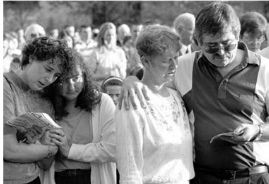
Left and above: people come together in remembrance of the victims at the candle-lit vigil attended by 5,000 people on the Tuesday after the bombing.