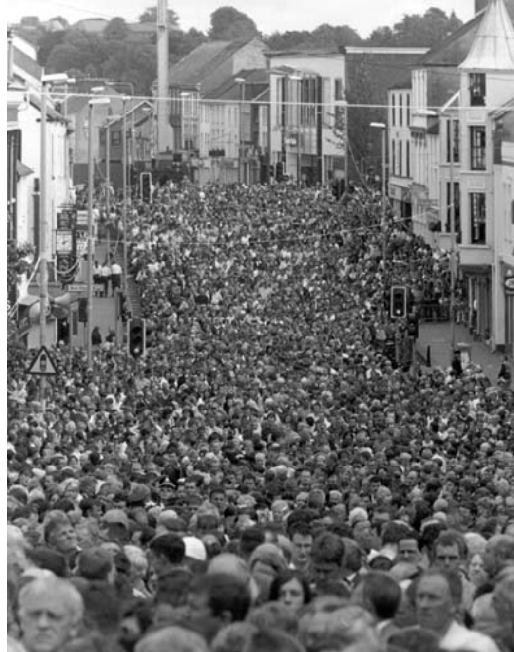
Right: Mourners pack the centre of Omagh for the Act of Prayerful Reflection a week after the bomb attack.