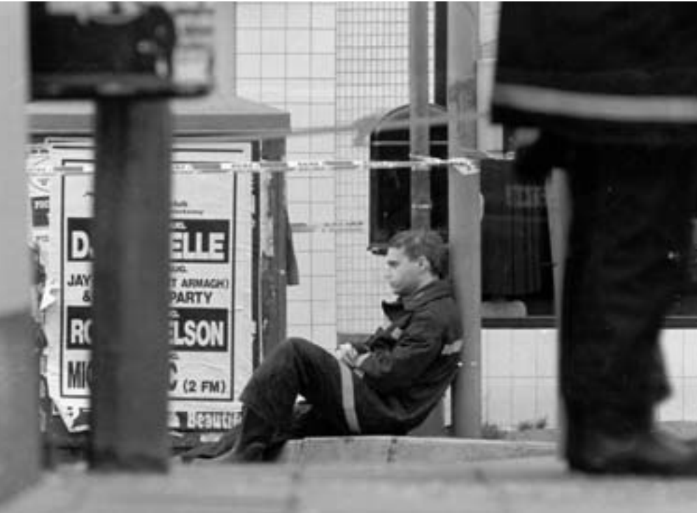
Above: An exhausted fireman takes a break from the testing task of sifting through the rubble at Market Street.