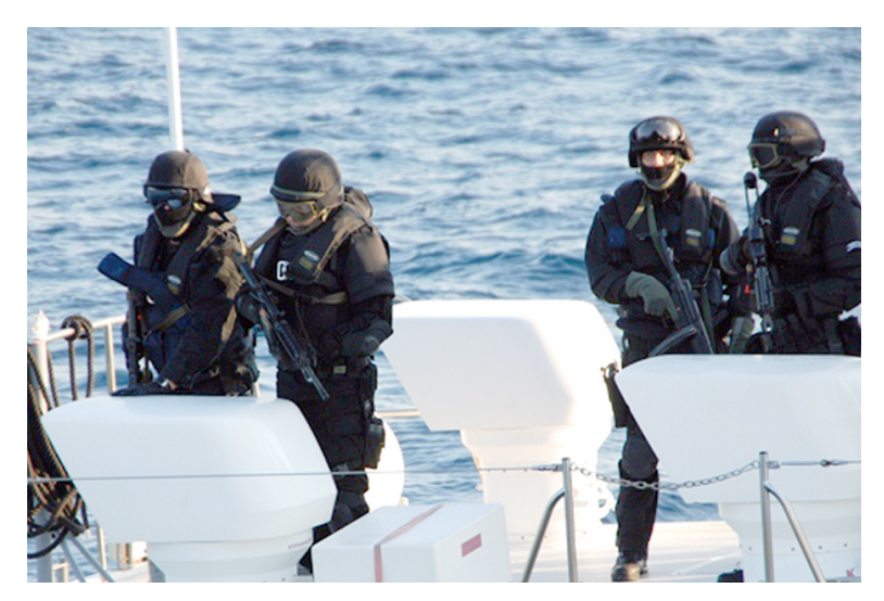
Armed coastquards make it clear that Greece will not let the Gaza boat travel any farther.