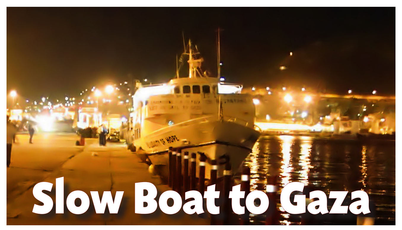
The Audacity of Hope in a Greek military dock after being impounded by coastquards.