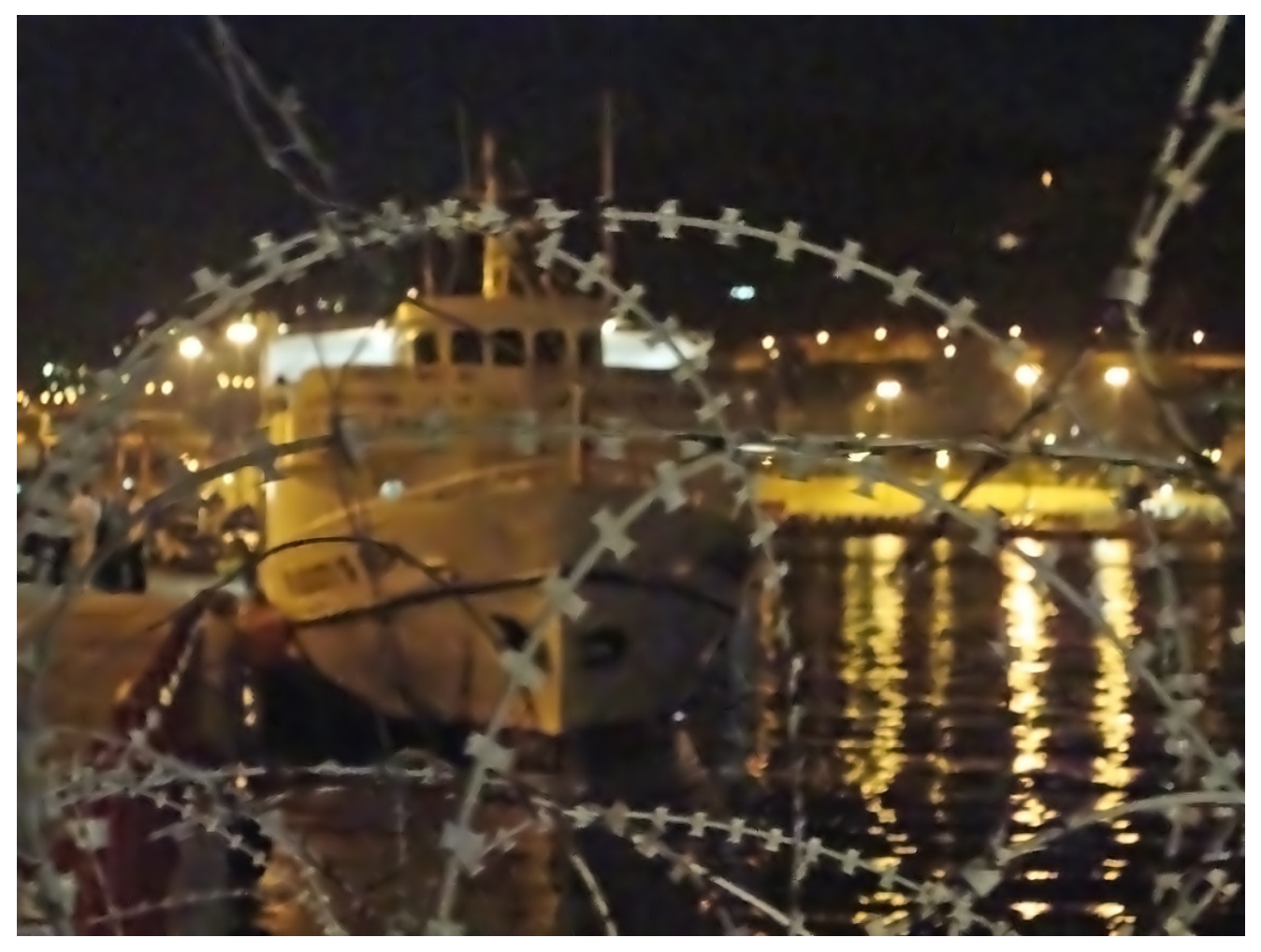
Impounded at a military dock, the Audacity of Hope is out of action ... for now.