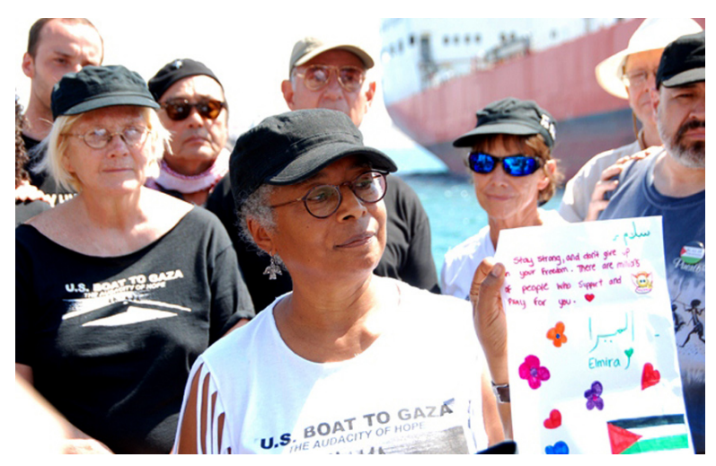
Author Alice Walker displays one of the letters being taken to the entrapped residents of Gaza.