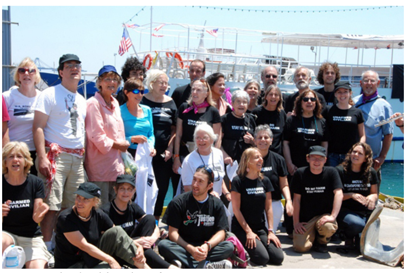
Passengers ready to board the Audacity of Hope.

with access to very senior staffers at the National Security Council that not only does the White House plan to do absolutely nothing to protect our boat from Israeli attack or illegal boarding, but that White House officials "would be happy if something happened to us."