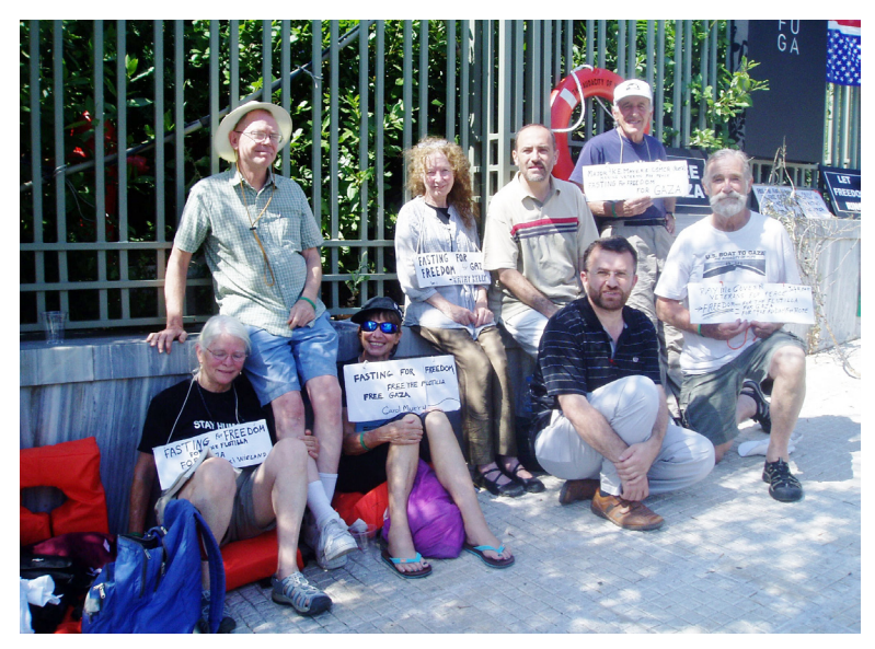
Home-made cards identify passengers who protested outside the US embassy in Athens on July 4.

On Saturday, we were on a coast guard wharf with the boat impounded, the crew restricted, and the captain facing some significant charges.