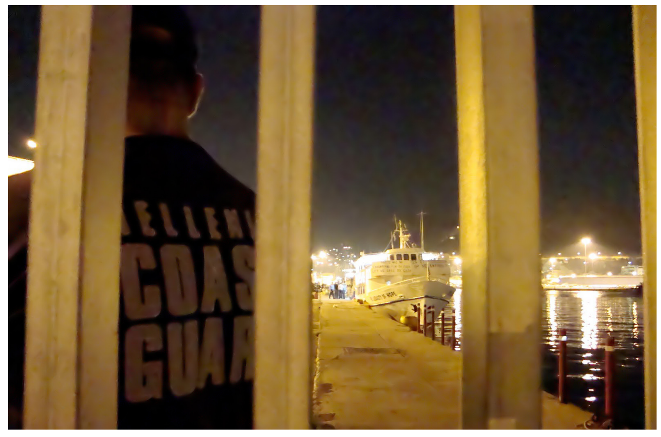
Guarded by Greek coastguards, the relief boat stands at the dockside.

By putting the issue of Israel's blockade front and center, we also managed to force discomforted US State Department spokespersons to dissemble about the legality of Israel's illegal blockade. They ducked declaring something so clearly illegal legal, knowing that otherwise they would have invited international ridicule.