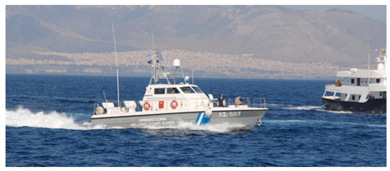
Greek coastquard vessel cuts off the Audacity of Hope as it runs for ternational waters.