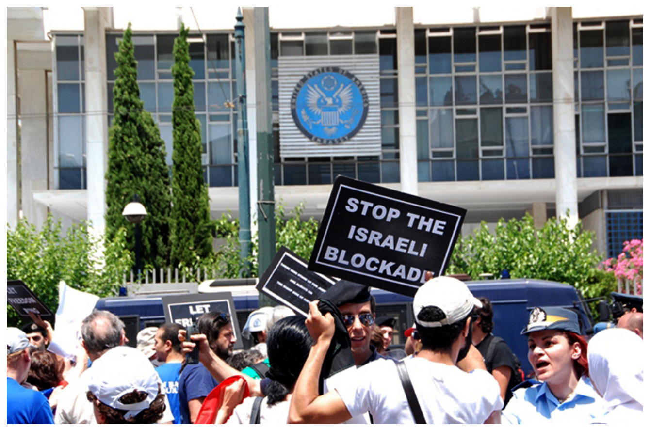
Noisy protest outside the US embassy after the boat is refused permission to sail to Gaza.