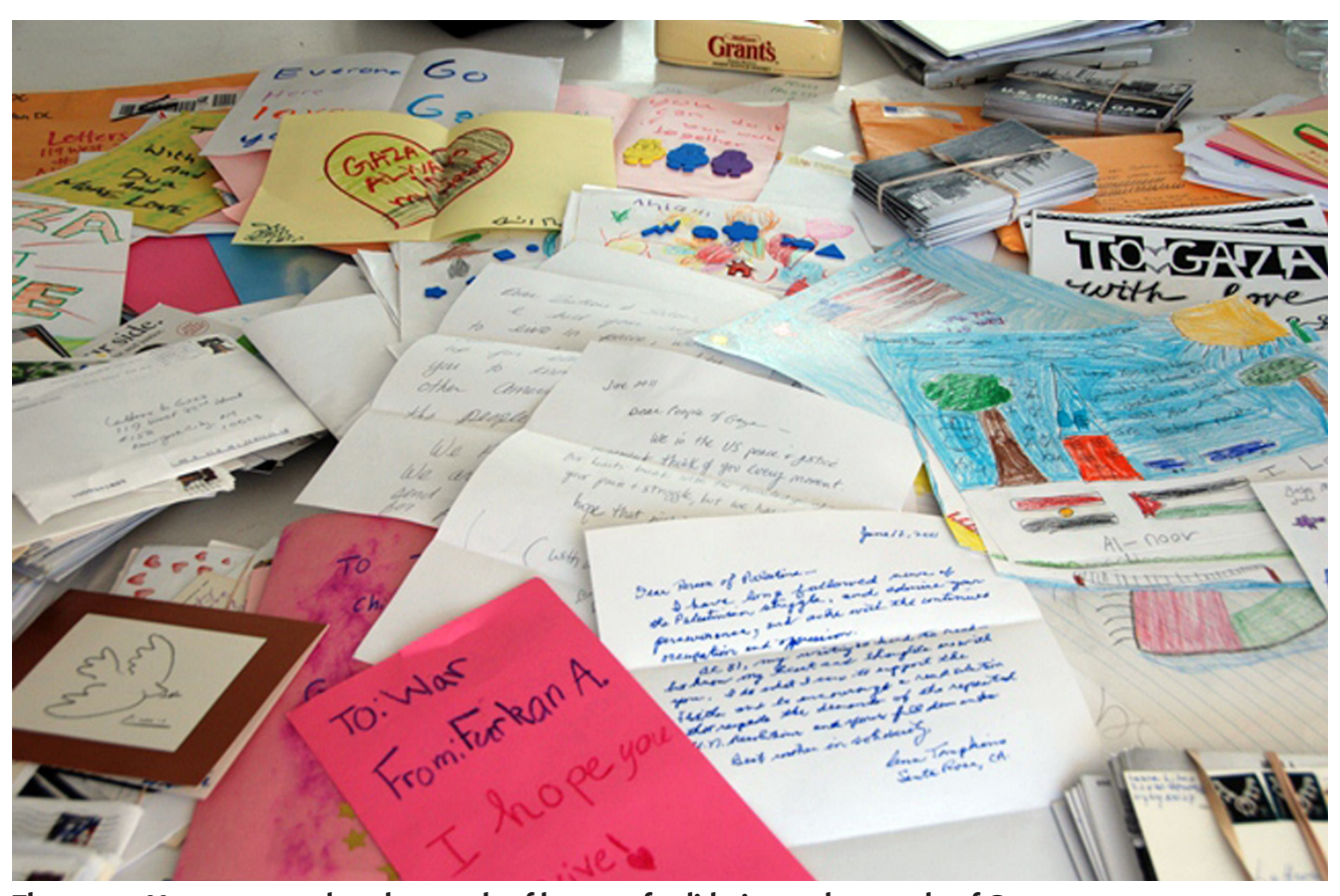
The cargo: Not weapons, but thousands of letters of solidarity to the people of Gaza.

while minimal, confirmed his view that the United States was a debauched and racist country."