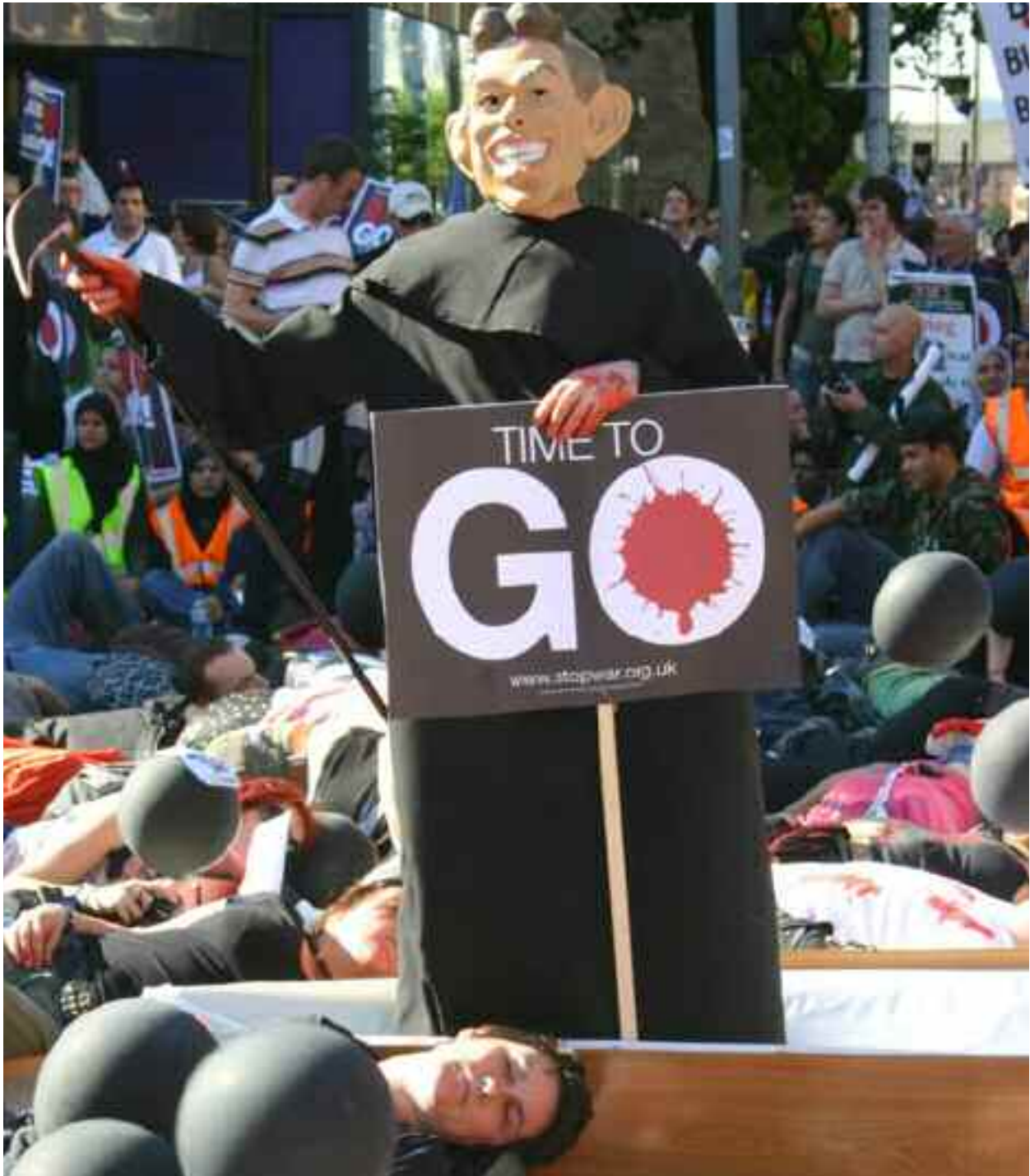
THE SMILING REAPER: An activist wears a Tony Blair mask as hundreds of people take part in a die-in in sympathy with victims of the Iraq war at a demonstration in Manchester on September 23, 2006, before Blair's final address as Prime Minister to Britain's Labour Party Conference.