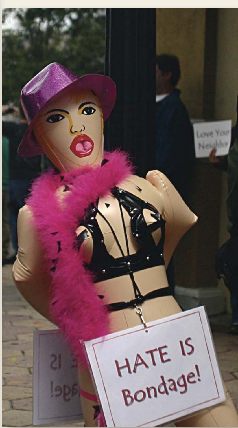
MOUTHING OFF: A blow-up sex doll provided the strongest message of the day.