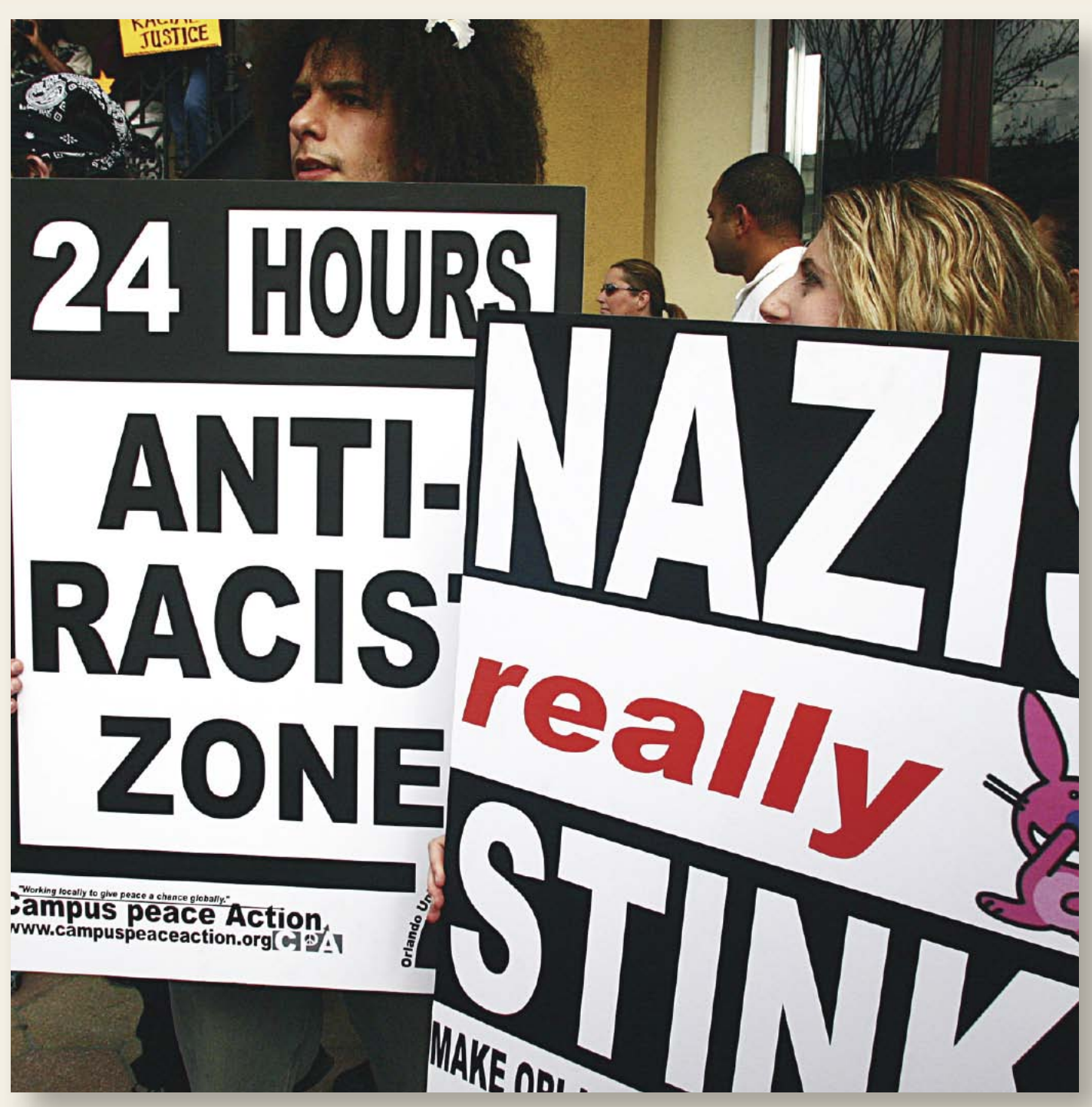
NEARLY RIGHT: Anti-Nazi protesters carry signs, at least one of which had an incorrectly-inked Nazi logo, and jeer the Nazis. 17 of the protesters were arrested by the cops.