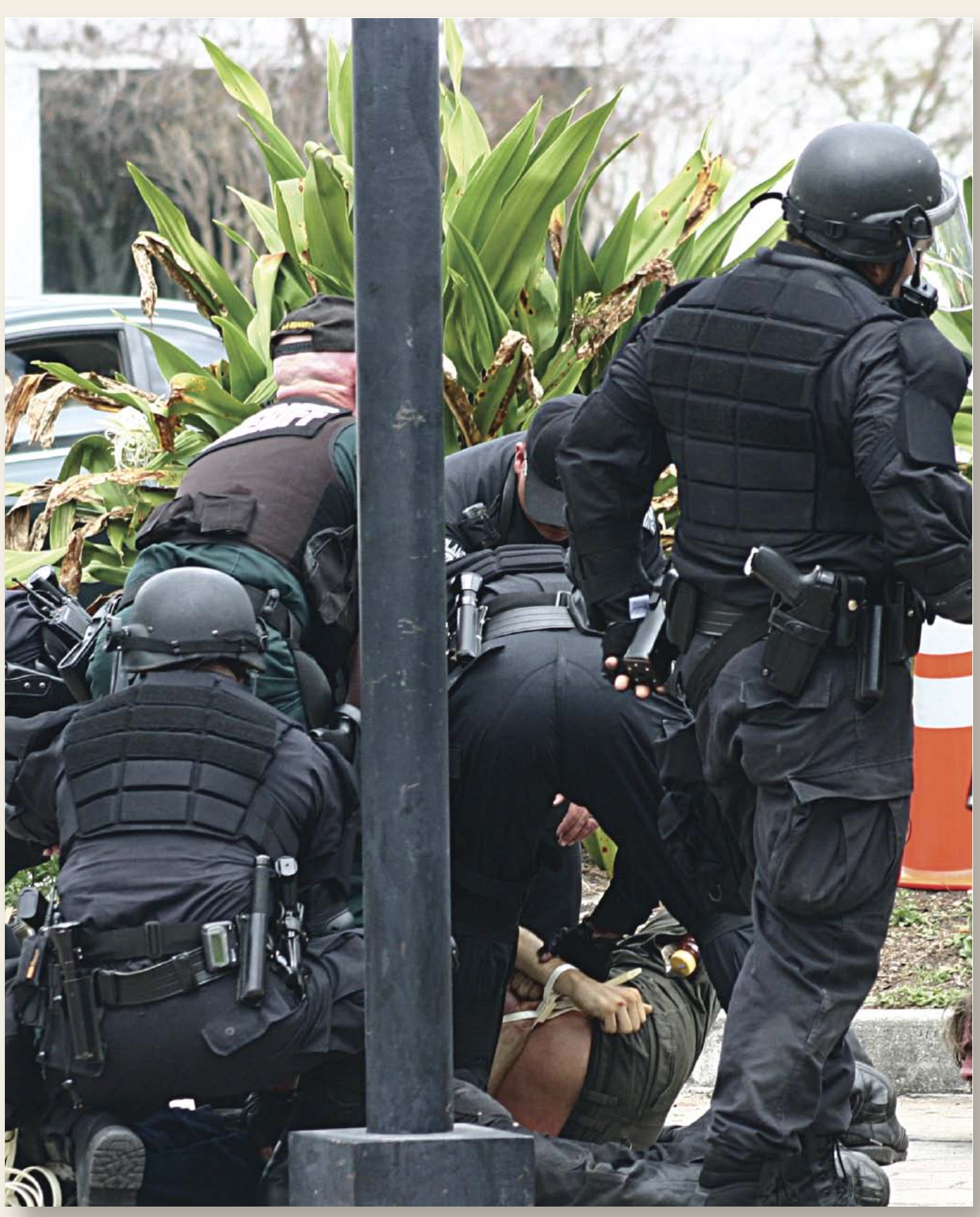
THE ENEMY WITHIN?: An anti-Nazi protester is dragged away by police before the beginning of the march. Police said 17 people were arrested for offenses including wearing masks, and fighting with police and other protesters.