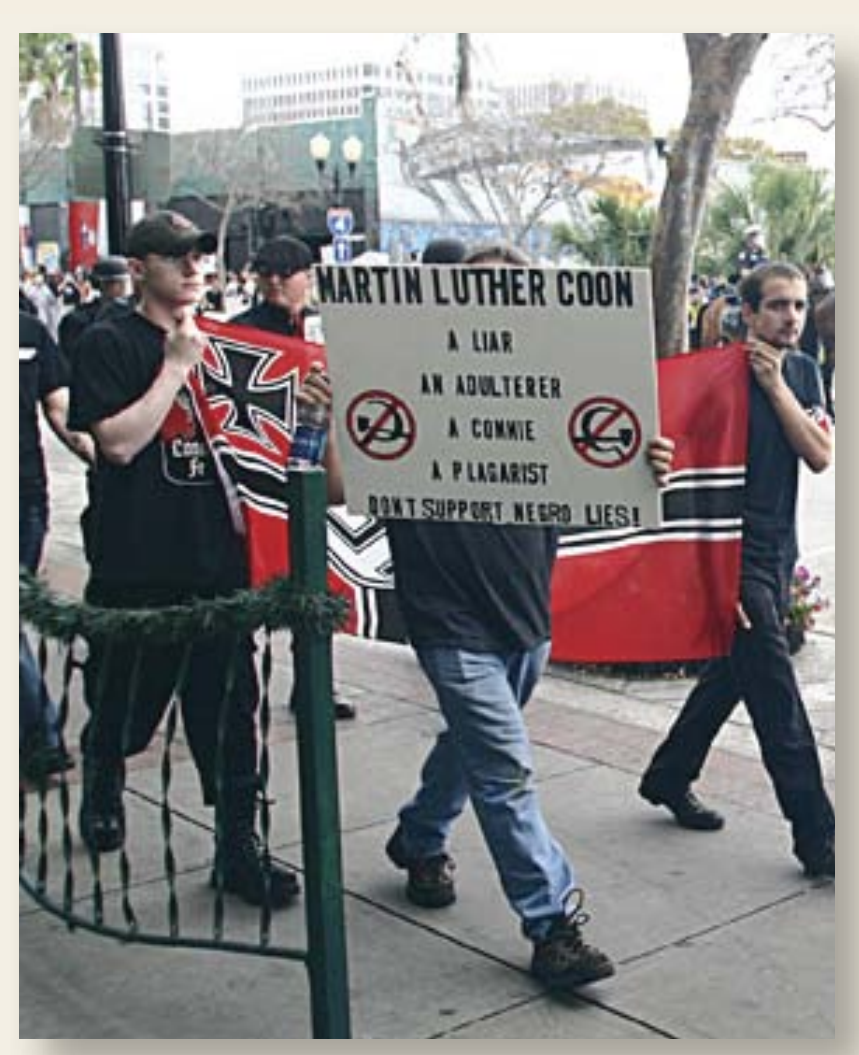
PROVOCATIVE: A Nazi supporter displays a sign disparaging Martin Luther King.

footage of ordinary folks beaten with wooden clubs, shocked with Taser guns, and shot at with rubber bullets, even while on their knees praying. Elderly people maced in the face and dragged across the ground in handcuffs and female protesters forced to strip before male cops. People who bother to find and watch these videos on the Internet keep saying the same thing over and over again: "This is not America."