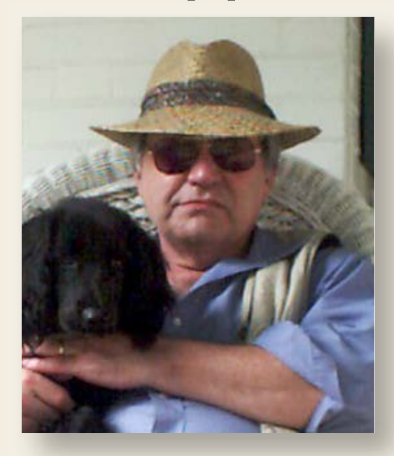
Joe Bageant's new best-seller is