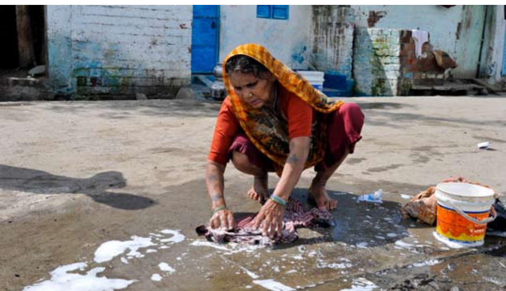
A woman washes her clothes with government-provided water which she says it is not safe for drinking: "It makes us sick and gives us ulcers and rashes – it's no good."