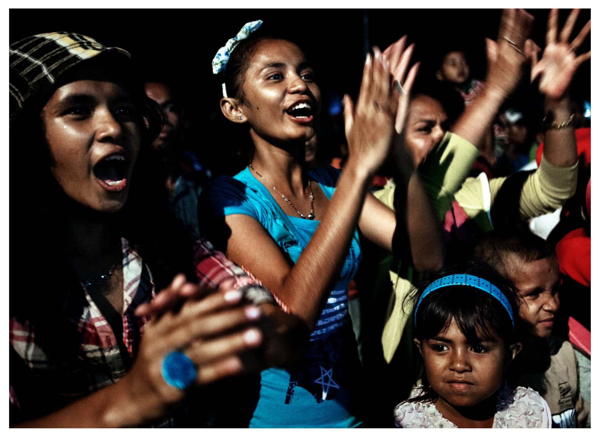
Ready for a peaceful life free from foreign intervention, Young Timorese enjoy a concert in Dili.