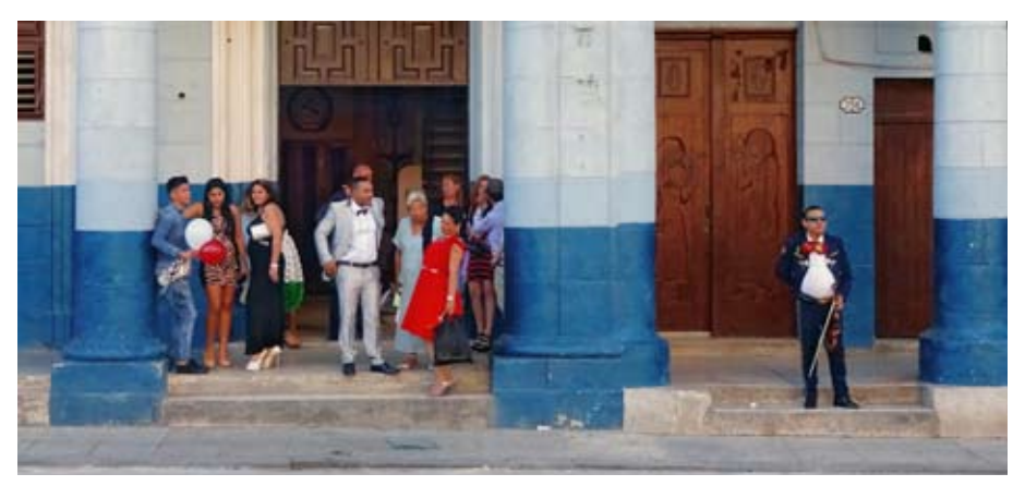
Homage to Havana – Pages 18-23