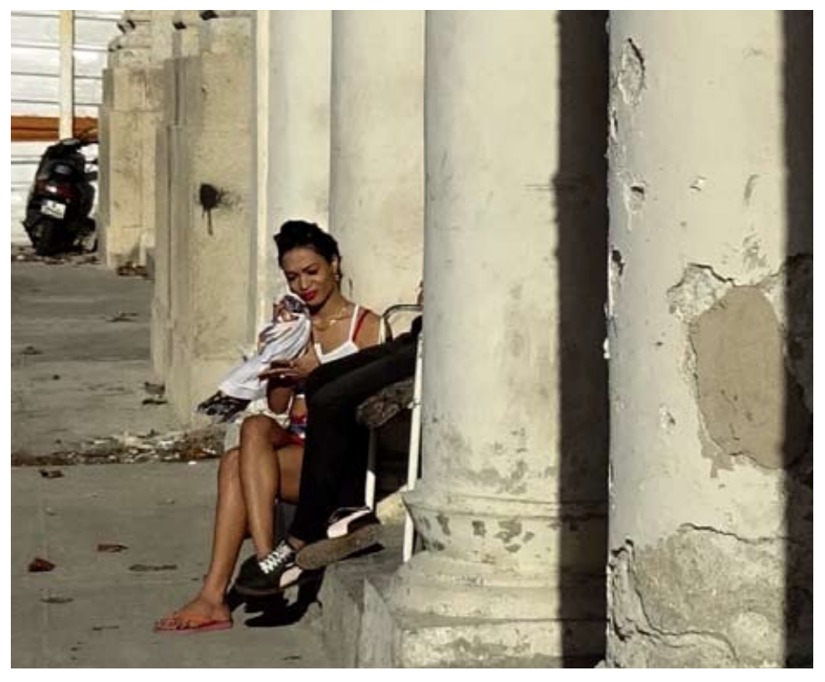
The Maiden of the Malecón

But there's an important difference between the Cuban hustle and all the others I've been party to in my travels to the socalled underdeveloped world, one that I think has a lot to do with the legacy of the