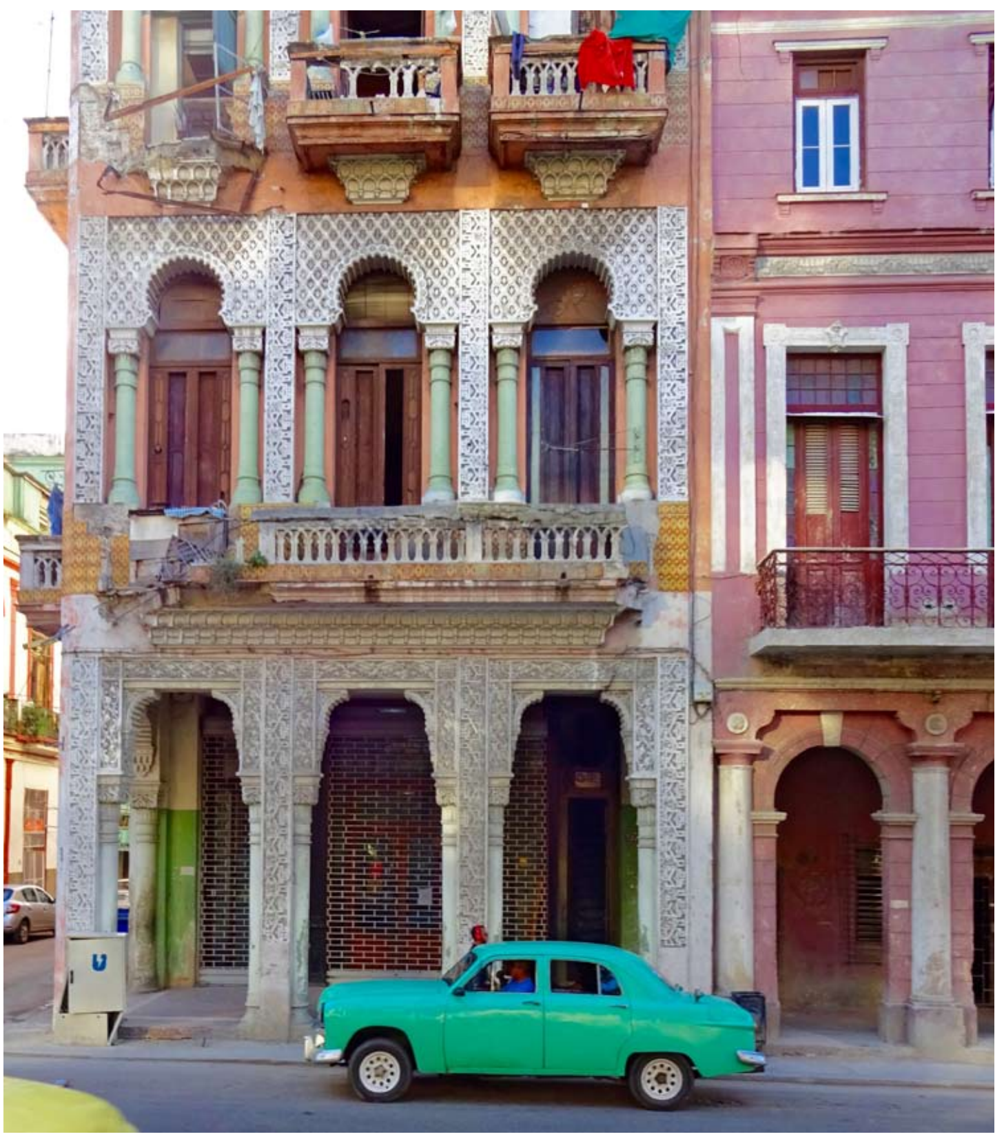
Green Car and a Slice of Al-Andalus