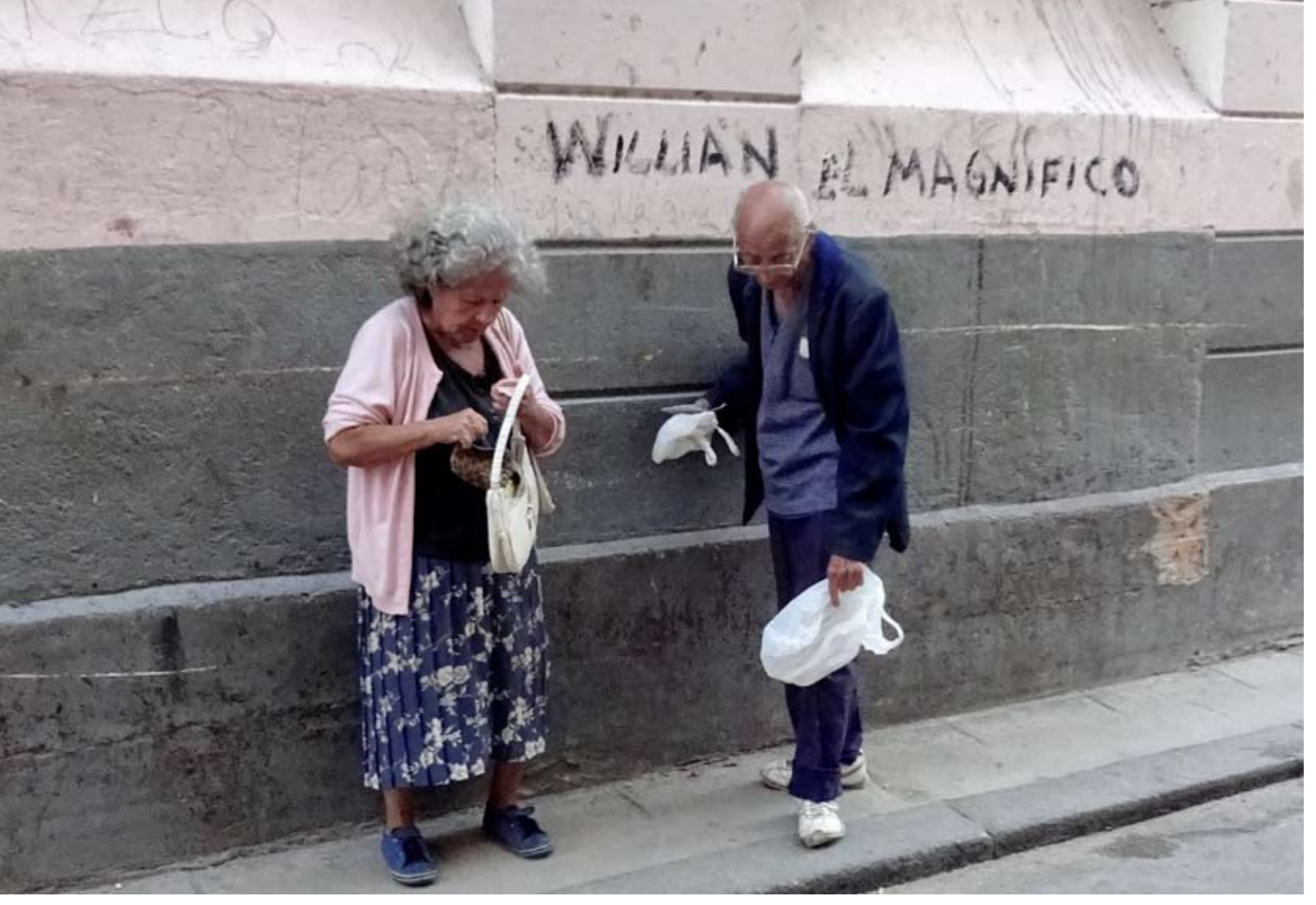
The Struggle of Senescence

ceptions not with its intimidating heft, but rather its frenetically schizoid bearing. It is both the most false and sincere of cities, and from moment to moment you never truly know which of its spirits will engage you in conversation, or will capture your eye.