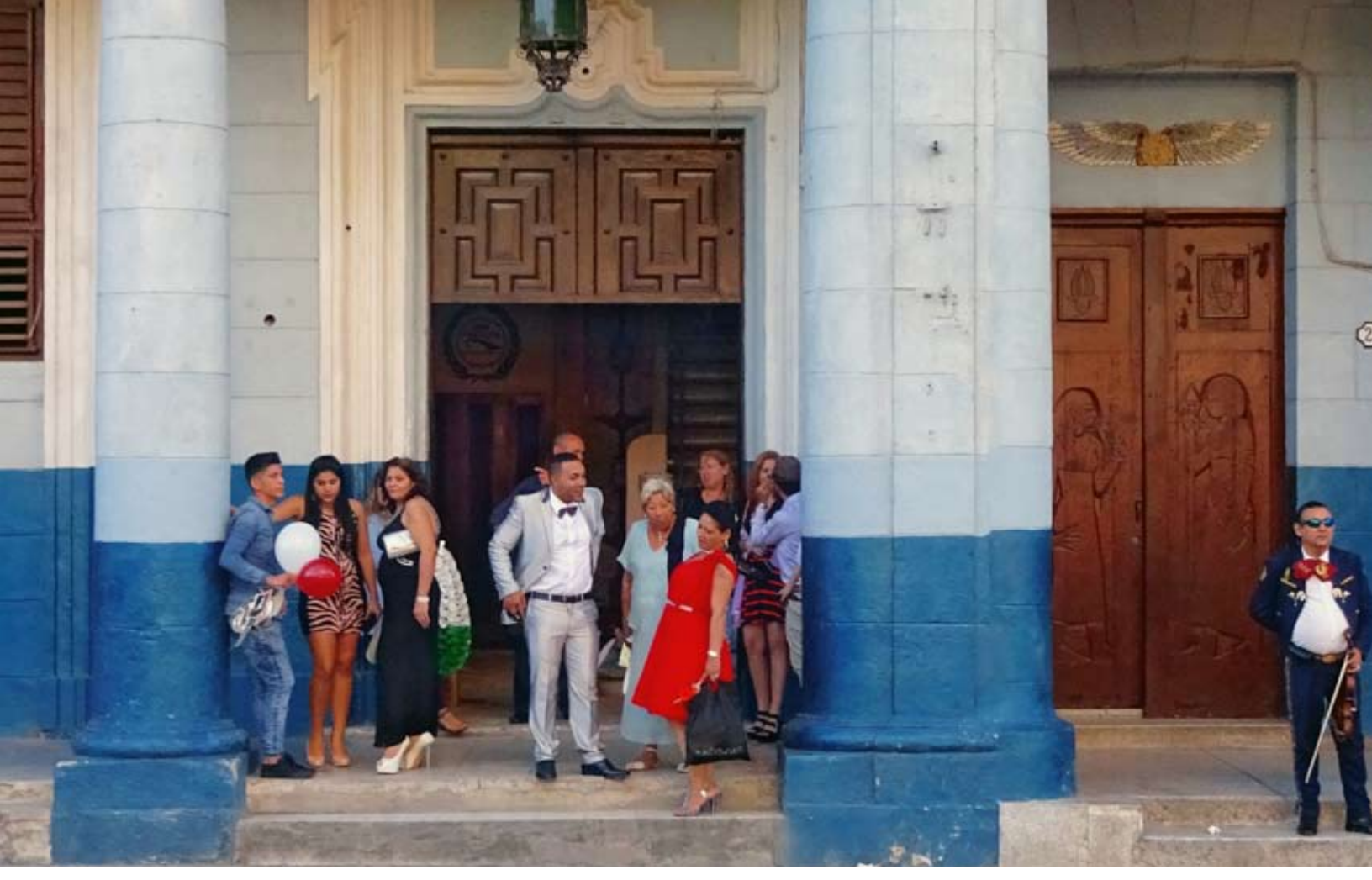
After the Syrian Wedding

Revolution. If it is done and when it is done, it is usually carried out with the full understanding on the part of the hustler that it is a necessary evil, a piece of theatre deployed not so much to mimic sincerity, but rather to protect it. Should the outsider recognise this game and frankly acknowledge its existence, things quickly change. What was baroque quickly becomes plain, what was opaque becomes surprisingly and alluringly diaphanous.