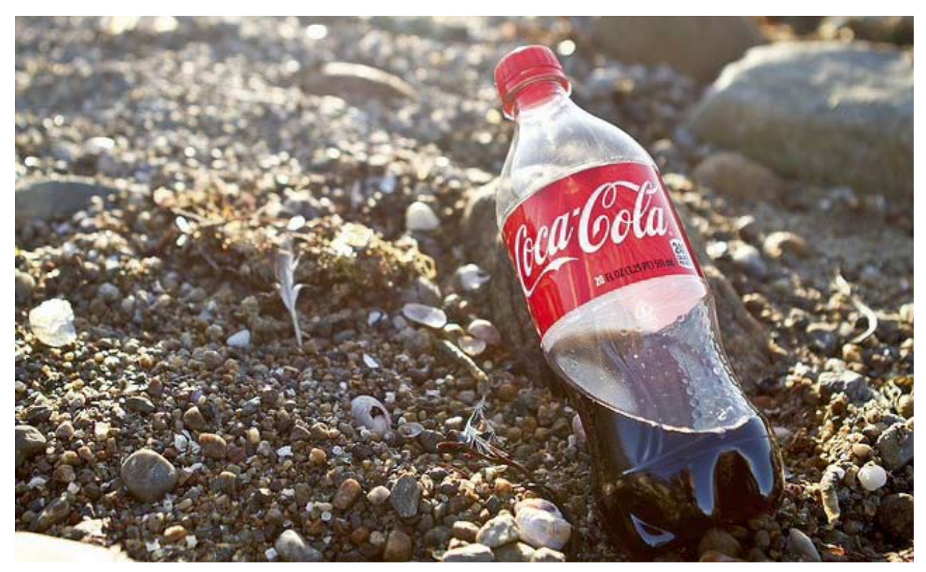
Energydesk discovered a leaked document from Coca Cola showing that it wanted to "fight back" against EU moves to introduce plastic bottle deposit return schemes.

unrecycled in the UK every day. The average household recycles just 270 of the 480 plastic bottles they use a year, according to campaign group Recycle Now. Many of those bottles that are not recycled can end up littering beaches and polluting the seas.