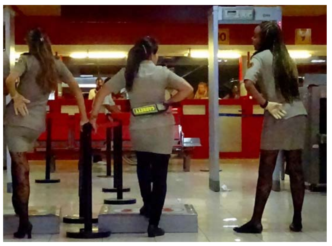
Cuba's Version of the TSA (Homage to Korda)