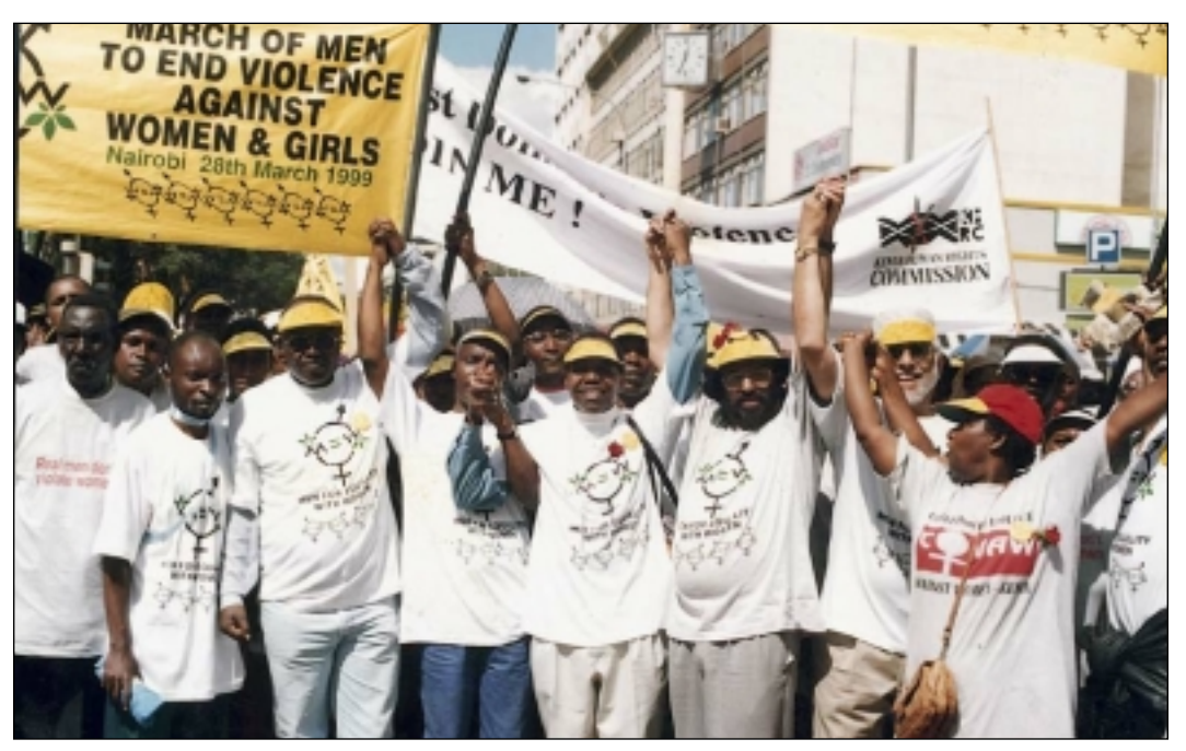
Marching against violence in Nairobi.