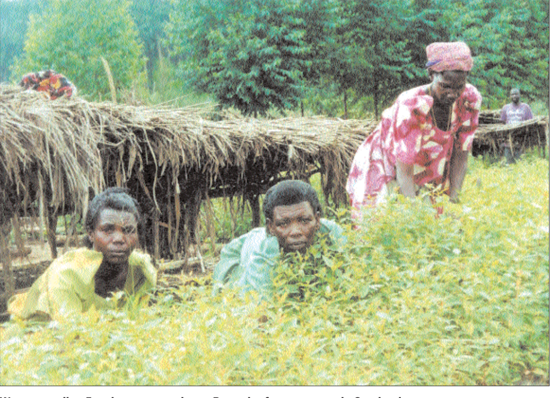
Women tending Eucalyptus nurseries at Butamira forest reserve in October last year.

Gazetted by the Busoga monarchy in the 1930s, Butamira was