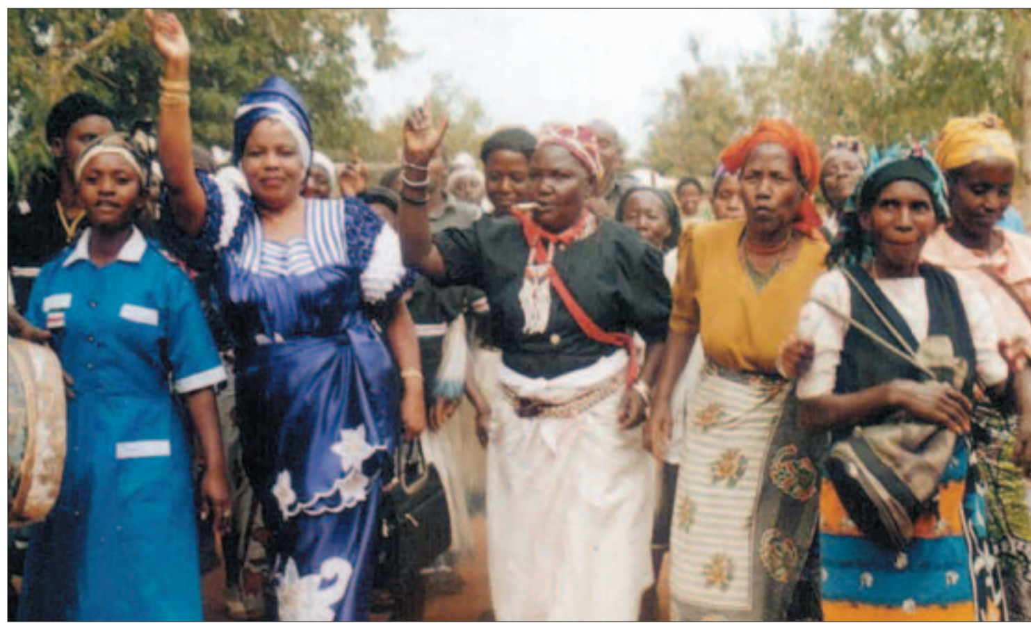
Many development programmes either ignore African women's contributions or actively work against them. What they expect is that leaders meeting in Johannesburg do more than meet and agree to make promises that they know they cannot practically fulfill.