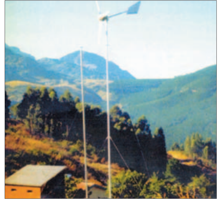
Energy crises in Africa's rural areas affect women worst.

In developing these technologies, however, consideration must be