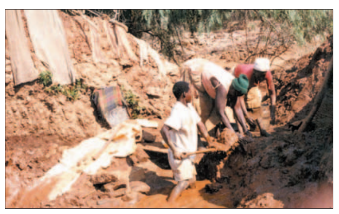
Unemployment has driven women into the strenuous exercise of collecting soil from disused mineshafts

Women are found in large numbers at panning sites. The speculators have set up haphazard settlements along riverbanks, from where they ply their trade. In some of these settlements, entire families – including women with babies – can be found digging incessantly all day in the hope of getting gold. Not only is their work a health threat, it also leads to environmental degradation and desertification