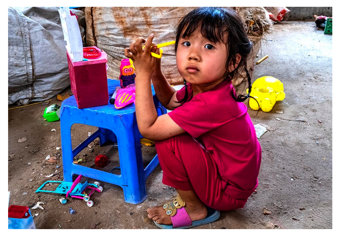
Rabbit playing with found plastic toys while her mom works in the plastic recycling plant.

Since "tiêu điêu" in Vietnamese is also "desolation," I joked, "That's what they get for growing desolation. They should switch to growing apricots [mai] and making fermented fish [mam]."