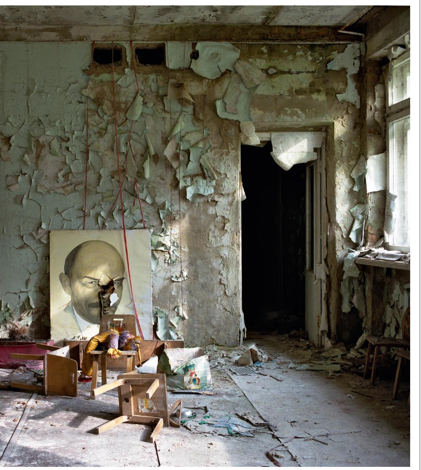
Portrait of Lenin, Kindergarten, October 1997