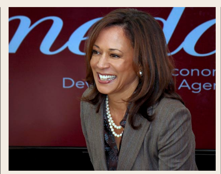
Kamala Harris: My pick for the Democratic ticket.