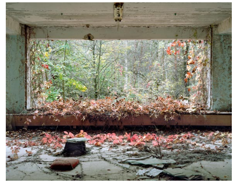
Lobby, Children's Hospital, October 2012

the deterioration of the built environment. This is a tragic place, but one which continues to offer mystery and surprise.