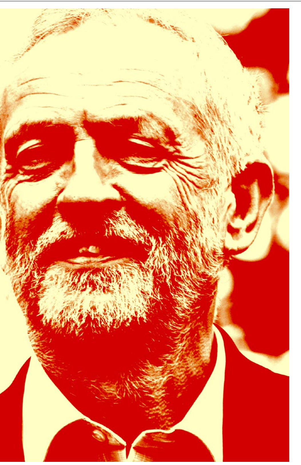
JEREMY CORBYN: Targeted by an amazingly virulent smear campaign.

Twitter post of a video warning about antisemitic conspiracy theories. There is nothing inherently wrong with warning people about antisemitic conspiracy theories (which are toxic for a whole host of reasons), but the video Corbyn chose to share explicitly cited criticism of Zionism as an example of one such conspiracy theory. Zionism is the racist ideology supporting the continued existence of a Jewish ethnostate (much like the white ethnostate sought by American white nationalists like Richard Spencer), and it is the driving force behind the oppression and persecution of the Palestinian people today.