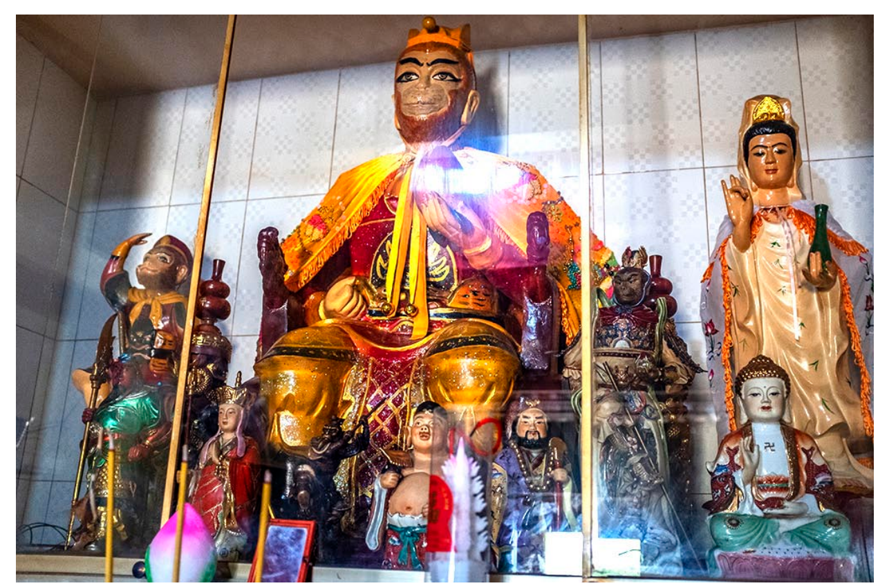
A shrine to the Monkey King in a shaman's house at Vinh Chau.