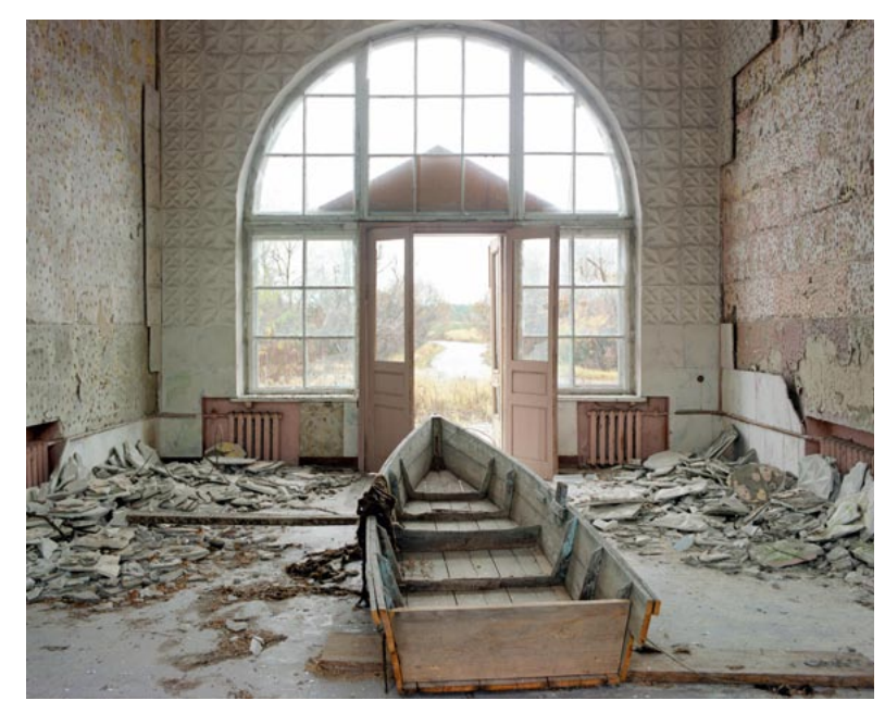
Railway Station, Village of Janov, October 1996