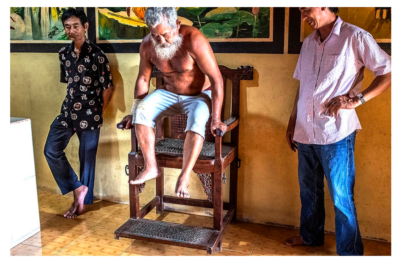
The shaman is about to land hard on chair of nails.

ful supplicants will bring gifts. He can channel the Monkey King, it is said, but isn't that a fictional character? Yes, but the Monkey King is based on Chinese mythology, so those who worship him insist there is such a god, as real as any, and there are perhaps a thousand temples dedicated to the Monkey King across the Chinese universe, with most of them in Fuzhou. Communists couldn't stand this. Trying to eradicate traditional religions and cults, they destroyed countless temples, including those worshipping the Monkey King, but in China and Vietnam, all these folk beliefs have made a huge come back.