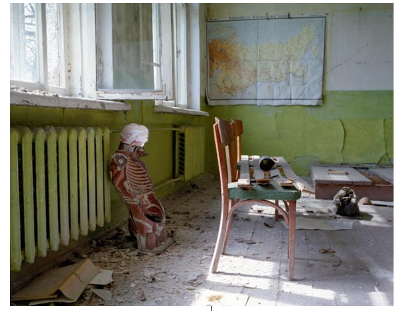
School, Village of Shipelicki, April 1995

remain. I've photographed almost exclusively within the city of Prypiat. Once home to 50,000 people, it was built to house the workers from the nuclear power plant, and several apartments were still under construction at the time of the accident. The city was considered one of the finest places to live in the former Soviet Union, with many schools, kindergartens, playgrounds, hospitals, and cultural facilities, but it will never be lived in again. Within this area, virtually untouched by civilisation since the 1986 accident, there have been dramatic changes that have become the subject of my photographs, particularly the proliferation of nature and