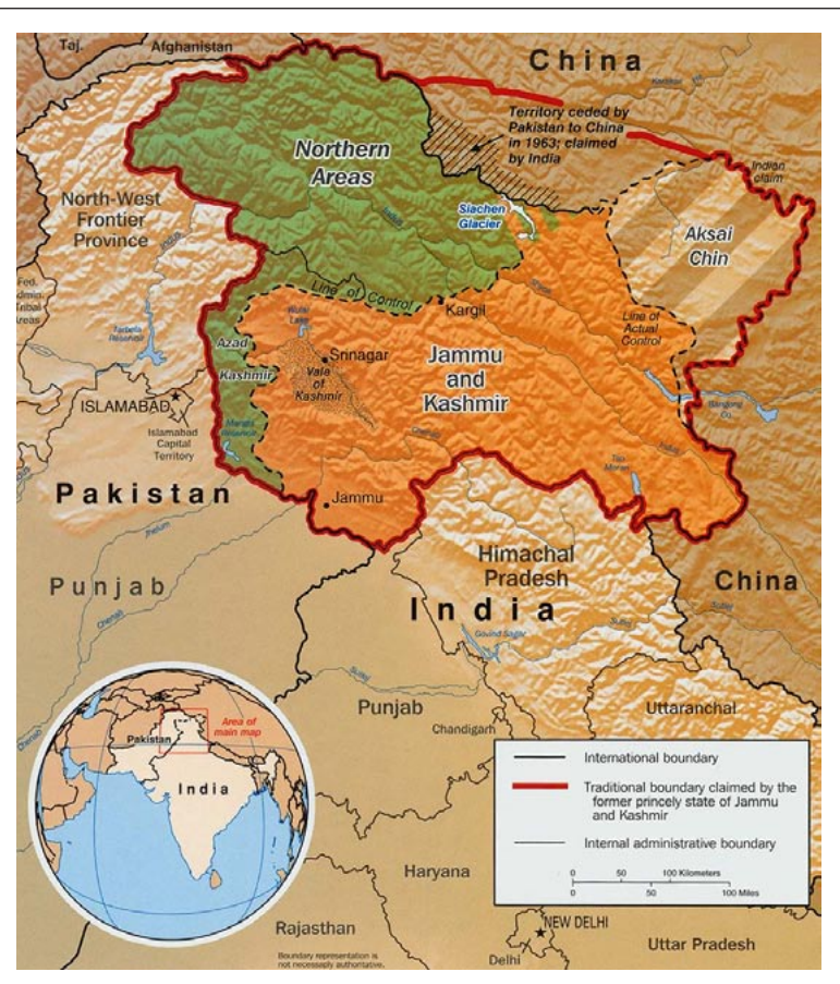
BATTLE LINES: The dispute between India and Pakistan over Kashmir could become a nuclear nightmare.

The study estimates that "two-billion people who are