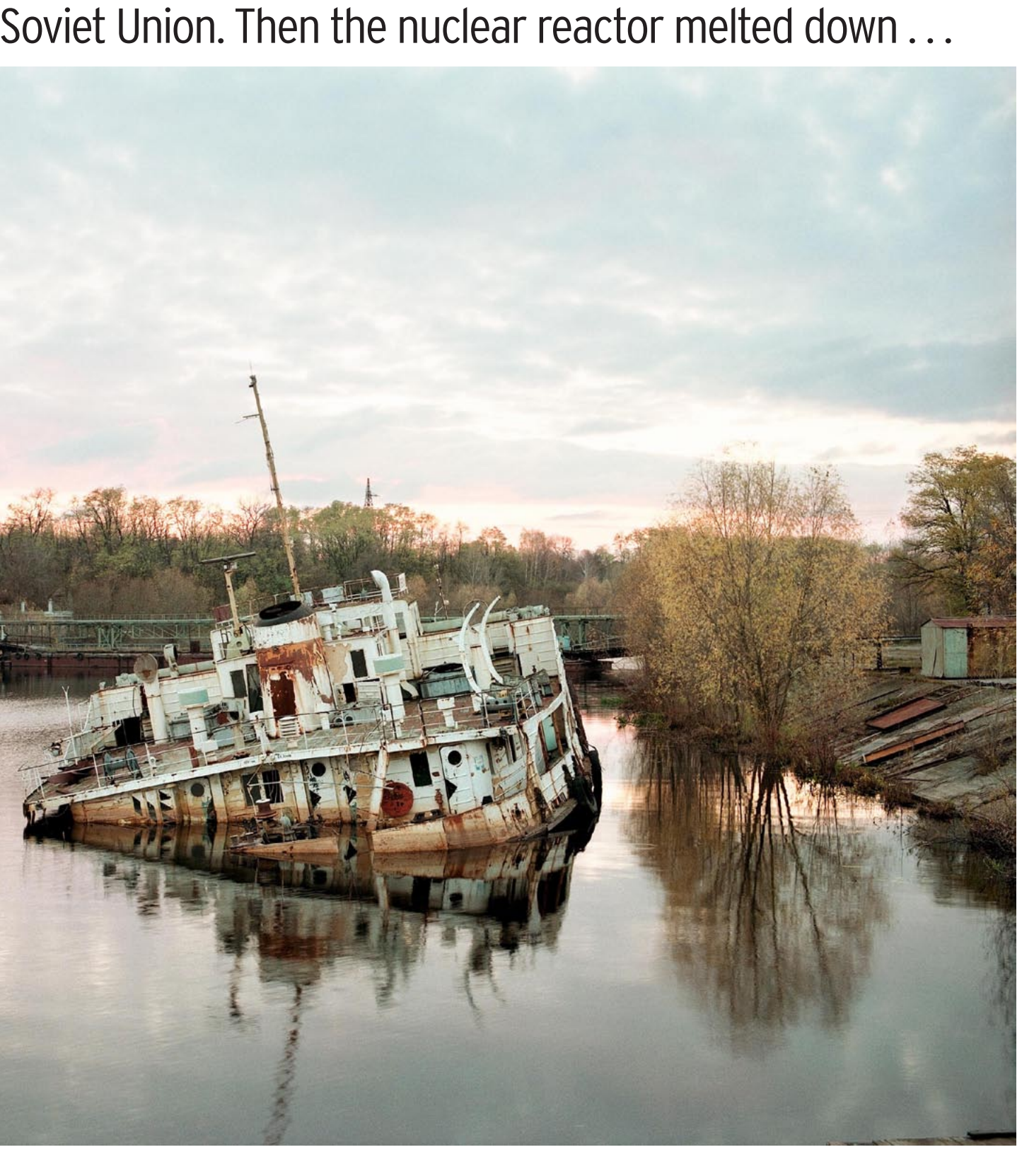
Sinking Boat on the Prypiat River, Chernobyl, October 1998