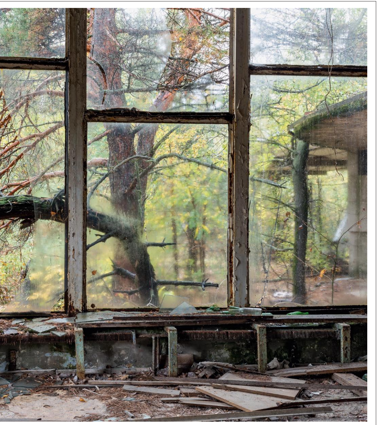
Riverside Cafe, Prypiat, October 2016