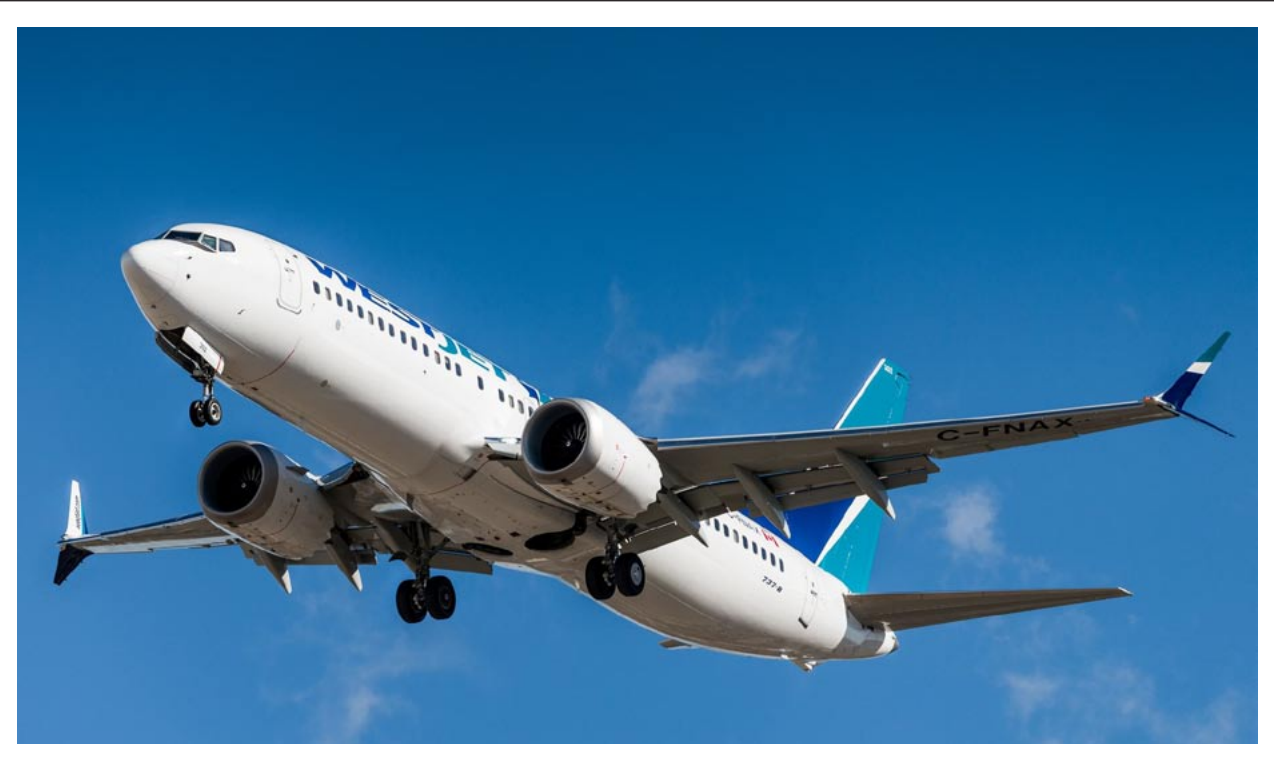
GROUNDED: WestJet Boeing 737 MAX 8 lands in Calgary, Alberta, Canada.

ny, but on temporary contracts, allowing airlines to pay them less and provide fewer benefits. Pilots are not even entitled to a free bottle of water while working and cabin crew are threatened if they do not reach sales targets. This creates a race to the bottom, as legacy airlines have to cut costs to compete with their budget competitors.