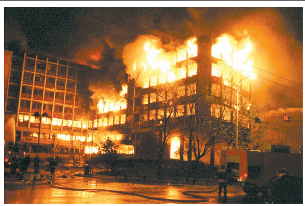
Belgrade in flames: Flashback to the US/UN war on Yugoslavia.

the Soviet Union, the imperialist powers launched a reckless and ultimately catastrophic scramble for the Balkans.