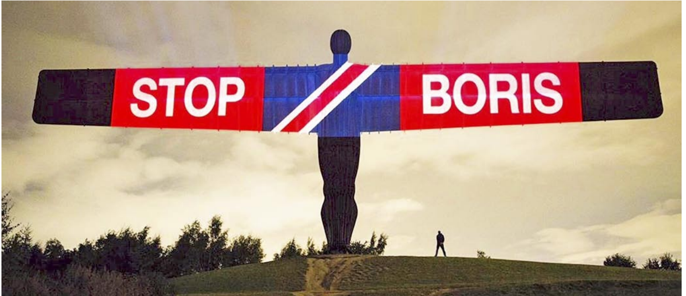
A simple message projected by Led By Donkeys on the iconic Anthony Gormley sculpture, Angel of the North

CAMPAIGN FOR PRESS AND BROADCASTING FREEDOM (NORTH) • Issue 5, December 2019 • £1