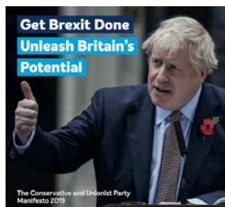
Covers of the manifestos issued by the three main political parties

The Section 40 decision is heavily criticised by Natalie Fenton of the Media Reform Coalition who says: 'Section 40 ... is key to persuading the press to join a recognised regulator through a system of carrots and sticks – if a news publisher joins a recognised