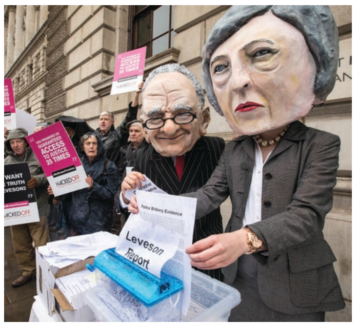
Campaigners dressed as Theresa May and Rupert Murdoch protest outside the Department for Culture Media and Sport at the prospect of May dropping the promised Leveson Inquiry 2

in different guises, and the unions were gutted. With no collective workers' voice in the workplace the news media sank into a mire of corruption – the long-suppressed phone-hacking scandal - and 10 years ago we abruptly found ourselves in a state of shock that offered a chance for change. Even the Labour Party, which had cosied up to powerful publishers even as they subjected it to humiliating treatment, joined the demand for a thorough investigation followed by effective regulation of the news media.