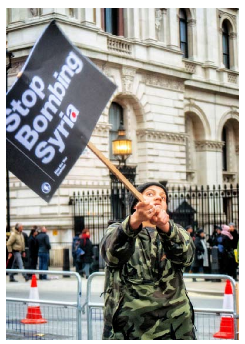
Demonstrator waves a banner at the Stop Bombing Syria protest in London on December 12, 2015.