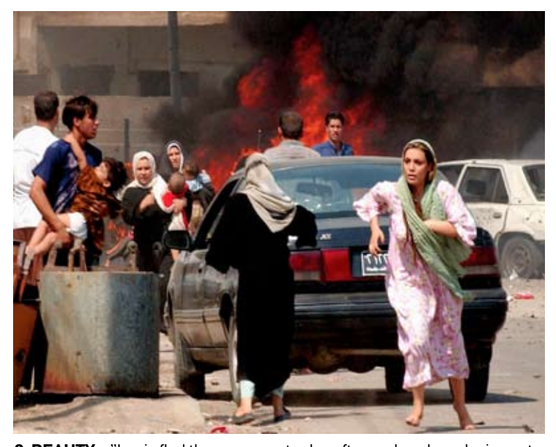
8. BEAUTY – "Iraqis fled the scene yesterday after car bomb explosions at a streetcelebrationoftheopeningofanewsewageplantin Baghdad. Twobombers drove their cars into crowds of children waiting to receive candy from GIs." NYT, October 1, 2004

Pietà . War death = Christ's death on the cross. The process of removing the body from the cross and battlefield is sacred. Mourning is always muted and respectful.