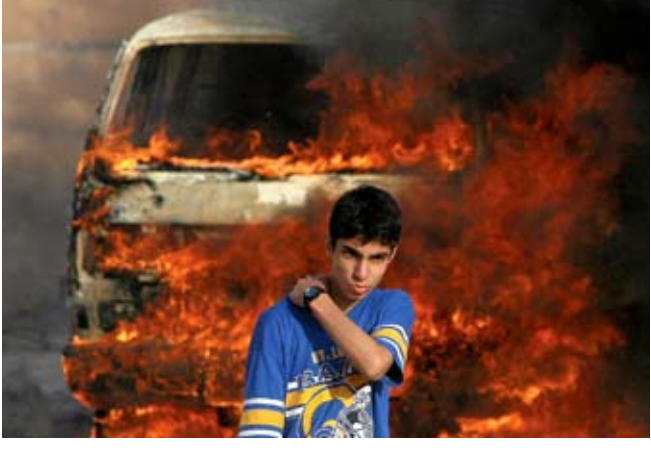
7. MOVIE – "Factions battle in the streets of Gaza: A Palestinian boy stood near clashes of Hamas and Fatah in Gaza City yesterday. The fighting has left at least nine Palestinians dead since Sunday, and the Palestinian interior minister resigned." NYT, May 15, 2007.

The paper is so integrated with the highest levels of authority that it knows precisely what truth the power wants told