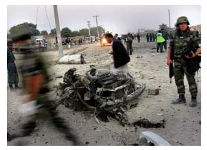
6. PAINTING – "High death tolls in Afghanistan and Iraq: In Kabul, Afghanistan, above, and in Iraq, civilians were under particularly fierce attack yesterday. Two bombings in Iraq left 23 people dead, and two American soldiers were killed. In Afghanistan. three bombings killed 18 people, including four Canadian soldiers." NYT, September 9, 2006.