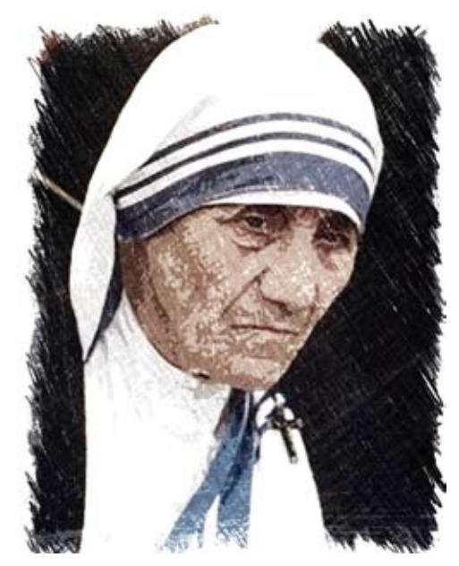
Saintly moneygrabber? Mother Theresa.

The money had been filched from the pockets of pensioners and small savers by