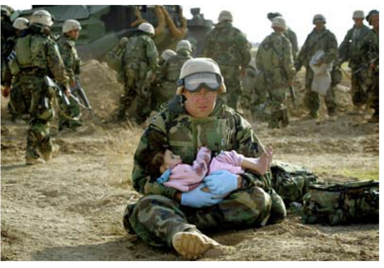
3. FATHER – "Crossfire: A marine doctor held an Iraqi girl after her mother was killed by crossfire on the front line near Rifa, American officers said." NYT, March 3, 2003.

of battle, death, destruction, and displacement.