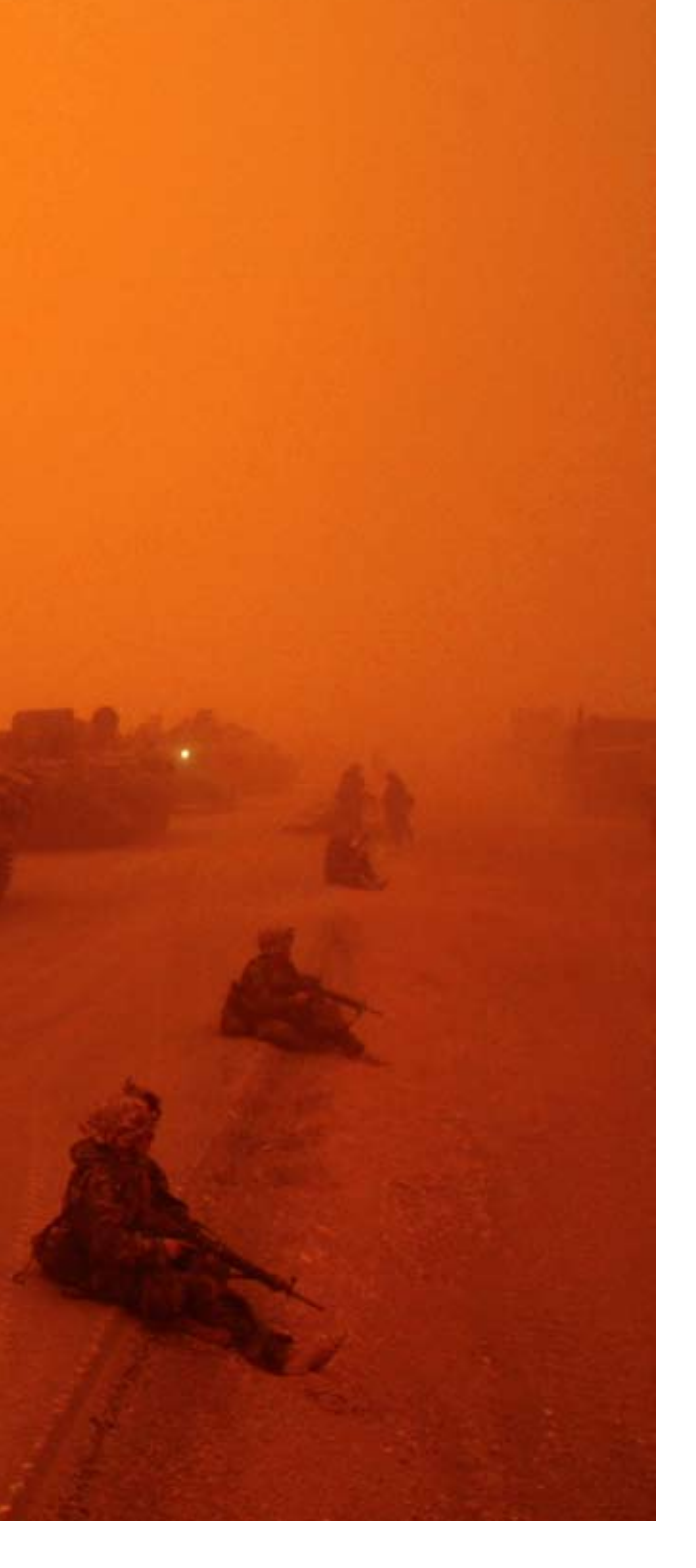
2. PLAYGROUND – "Drilling for war: Soldiers in the British First Batallion Parachute Regiment practised driving all-terrain vehicles in Kuwait. The American-led coalition may invade Iraq even before all allied troops arrive." NYT, March 16, 2003