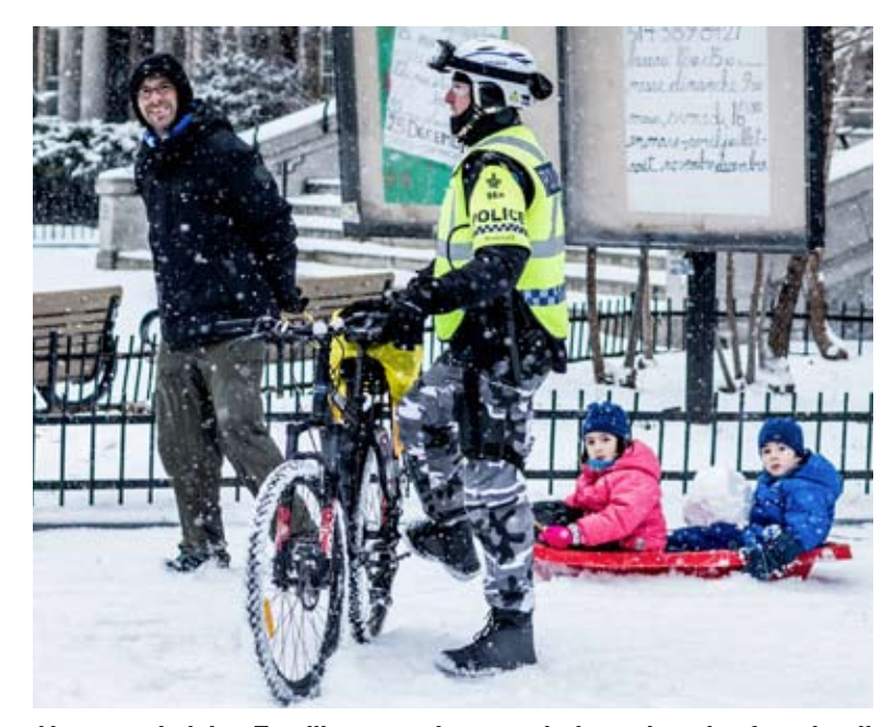
Above and right: Families pass by, wondering what the fuss is all about.

"Islamophobia is being instrumentalized and is being used by various parts of the political class," Singh told the CBC. "A handful of folks may or may not have gone to Syria, and suddenly we need a special hotline on extremism. This is being used to create a social crisis," said Singh. Tony Sutton