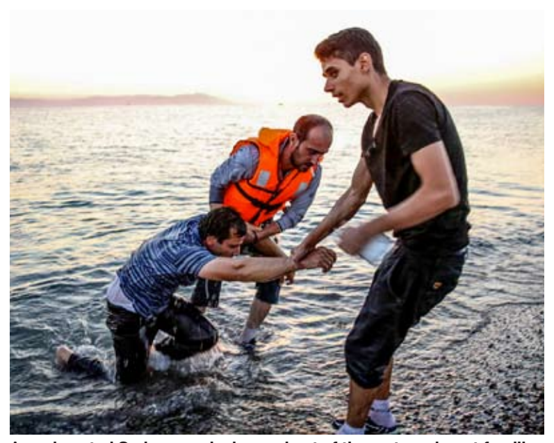
An exhausted Syrian man is dragged out of the water migrant families from Syria arrive in an inflatable dinghy on the island of Kos after crossing a 3-mile stretch of the Aegean Sea from Turkey.

Western states are building an increasingly deadly border control policy and importing military technologies to design sophisticated control systems and impassable fences in Greece, Bulgaria and the Spanish enclaves in Morocco. This truly creates what Foucault called the "conditions of possibility for others to die." Syrians are either left to struggle in Syria, or undertake highly risky journeys towards a safe but