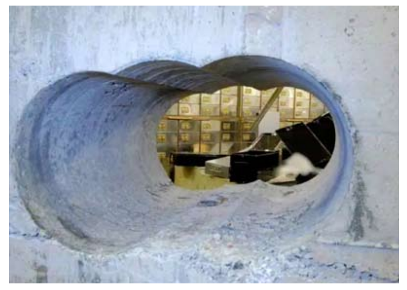
Holes bored through a half-metre thick concrete wall to access a vault in a safe deposit centre in Hatton Garden, London, where £14 million of diamonds and jewellery were stolen between April 2 and April 5, 2015.

The ex-robbers quickly mastered gold smuggling before turning their new-found knowledge to cannabis and cocaine importation