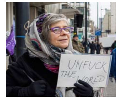
Signs of the times: Protesting in Montreal (far left) and in London (left). See Pages 16 - 19 and 46-51