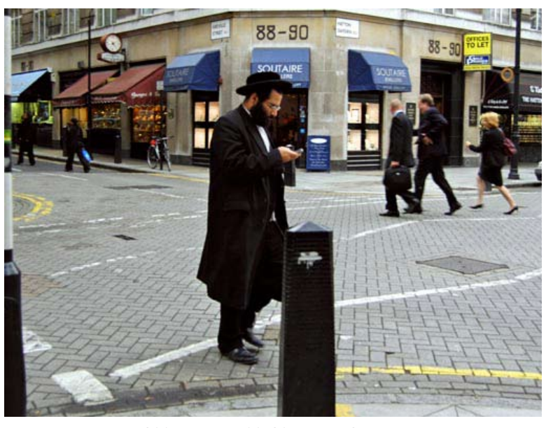
A Jewish trader in 2005 outside 88-90 Hatton Garden.

In a three-month period during 1987, Hatton Garden suffered six robberies and 10 burglaries