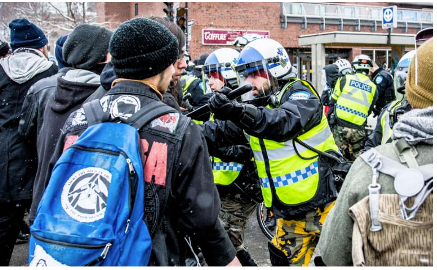
The cops use their batons to keep protestors away as the only arrest of the day takes place.

grant area that is predominantly North African," he said.