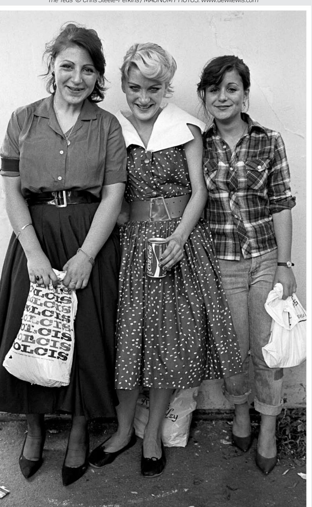
'The Teds'