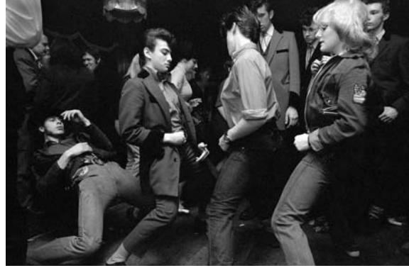
Far Right: Living in the other America (Pages 13-20)