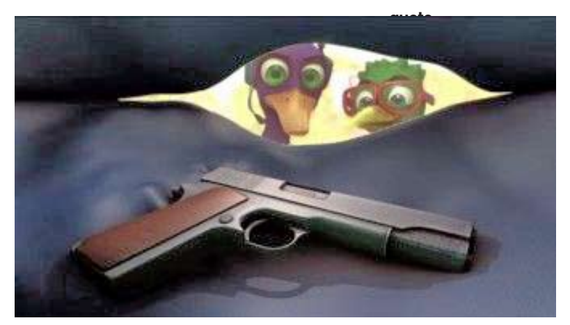
Eddie the Eagle: The NRA uses cartoons to market guns to kids.

The NRA wants kids to play with realistic toy guns and BB guns, since they believe that such toys are part of a child's initiation into the future ownership of perfectly real guns. At the moment, the gun lobby is concerned that not enough people have guns - even though the 270 million to 310 million of them already amassed around this country (according to the Pew Research Center) could arm just about every man, woman, transgendered person, and child around. Still, despite the fact that Americans can now carry guns in all 50 states and the NRA continues to win most of the big political fights, the number of households with guns is actually down from its peak in the late 1960s (though those that are armed have more and deadlier weapons than ever before). No wonder the gun