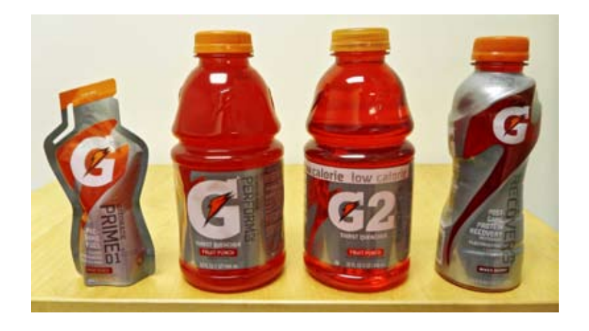
ENERGETIC GROWTH: The first experimental batch of Gatorade sports drink cost £28 to produce but has spawned an industry with sales of around £260million a year in the UK alone.

Even more importantly, as sports drinks rise in popularity among children, they may be contributing to obesity levels. A 500ml bottle of a sports drink typically contains