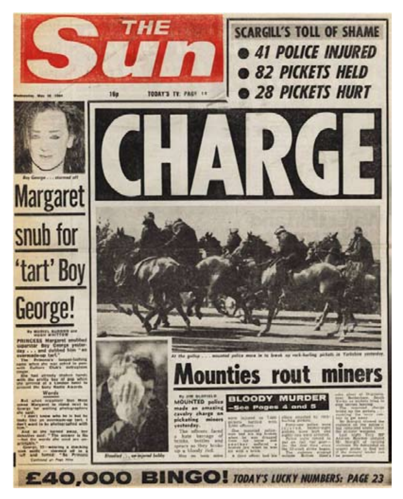
Front page of the Sun newspaper blamed the striers for the violence.