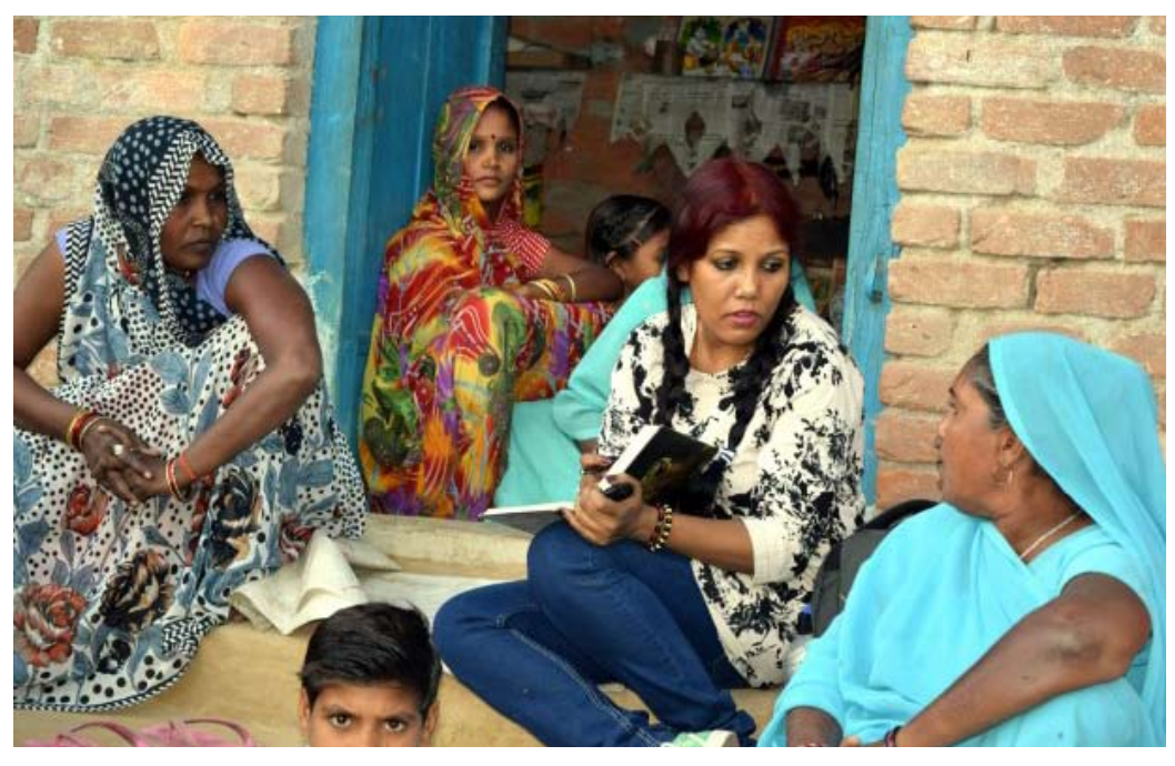
Paul interviews Dalit women in Hamirpur - a district in Northern India. All of these women have been abandoned by their husbands who fled to escape drought.

More than 500 million people in India, almost half of the total population, still defecate in the open