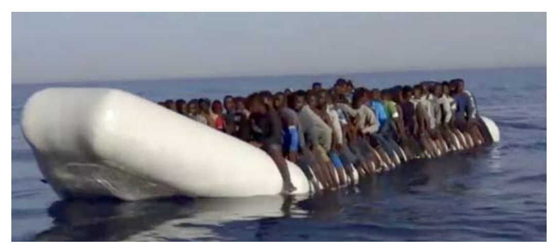
Fleeing to safety: Boat people in the Mediterranean.